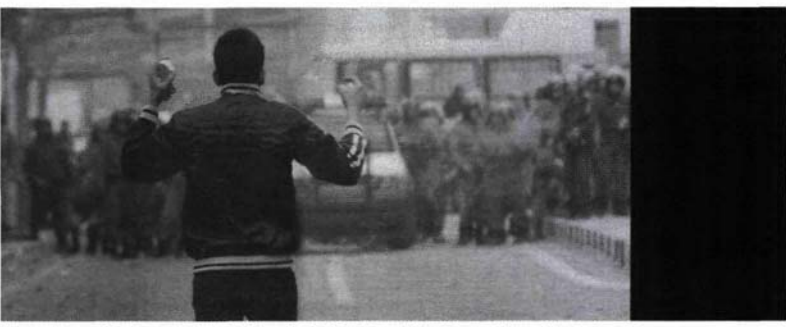
Above: Marco Fusinato, The Infinitive 4, 2015, white UV halftone ink on black aluminium, 250 x 625cm, Chartwell Collection, Auckland Art Gallery Toi o Tāmaki, purchased 2015

Left: Luke Willis Thompson, Cemetery of Uniforms and Liveries (video still) 2016, 16mm, b&w, silent; 9.1@16fps, Kodak Tri-X 16mm b&w reversal stock, HD video telecine transfer. Chartwell Collection, Auckland Art Gallery Toi o Tāmaki, purchased 2017