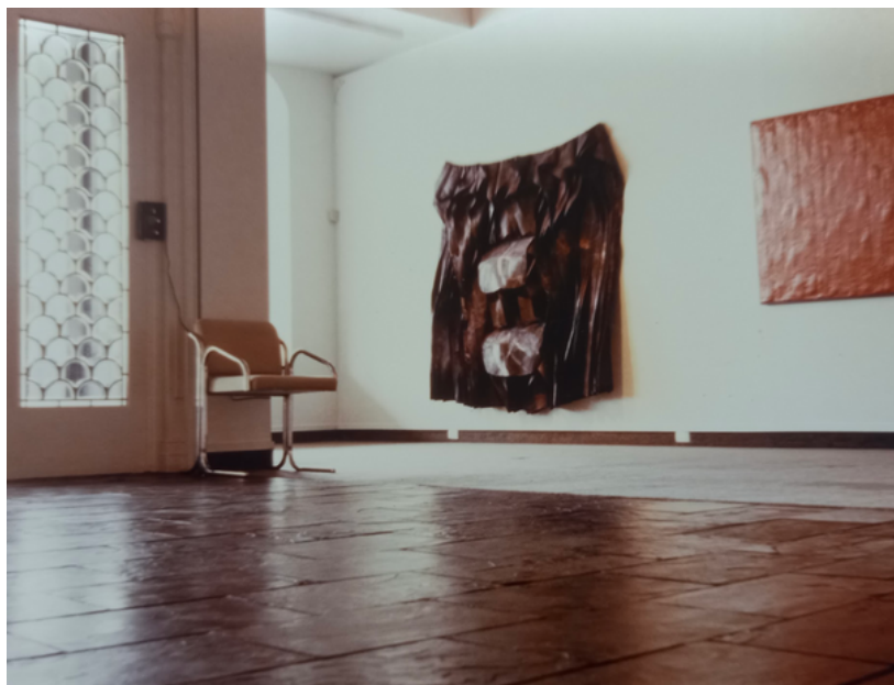
A Chartwell Chair, Centre for Contemporary Art, Hamilton 1990.